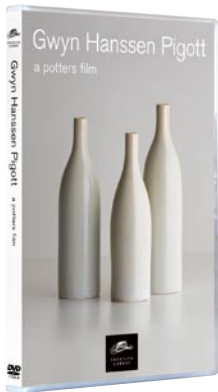
Gwyn Hanssen Pigott a potters film